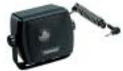
External Speaker SP-7