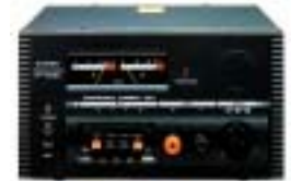
AC Power Supply(30A) FP-1030A