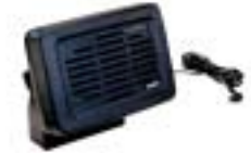
High-Power External Speaker MLS-100